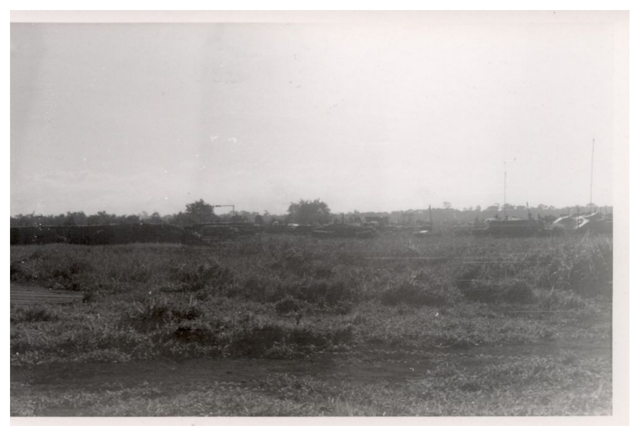
A View of FSB ZIGGIE from outside the base