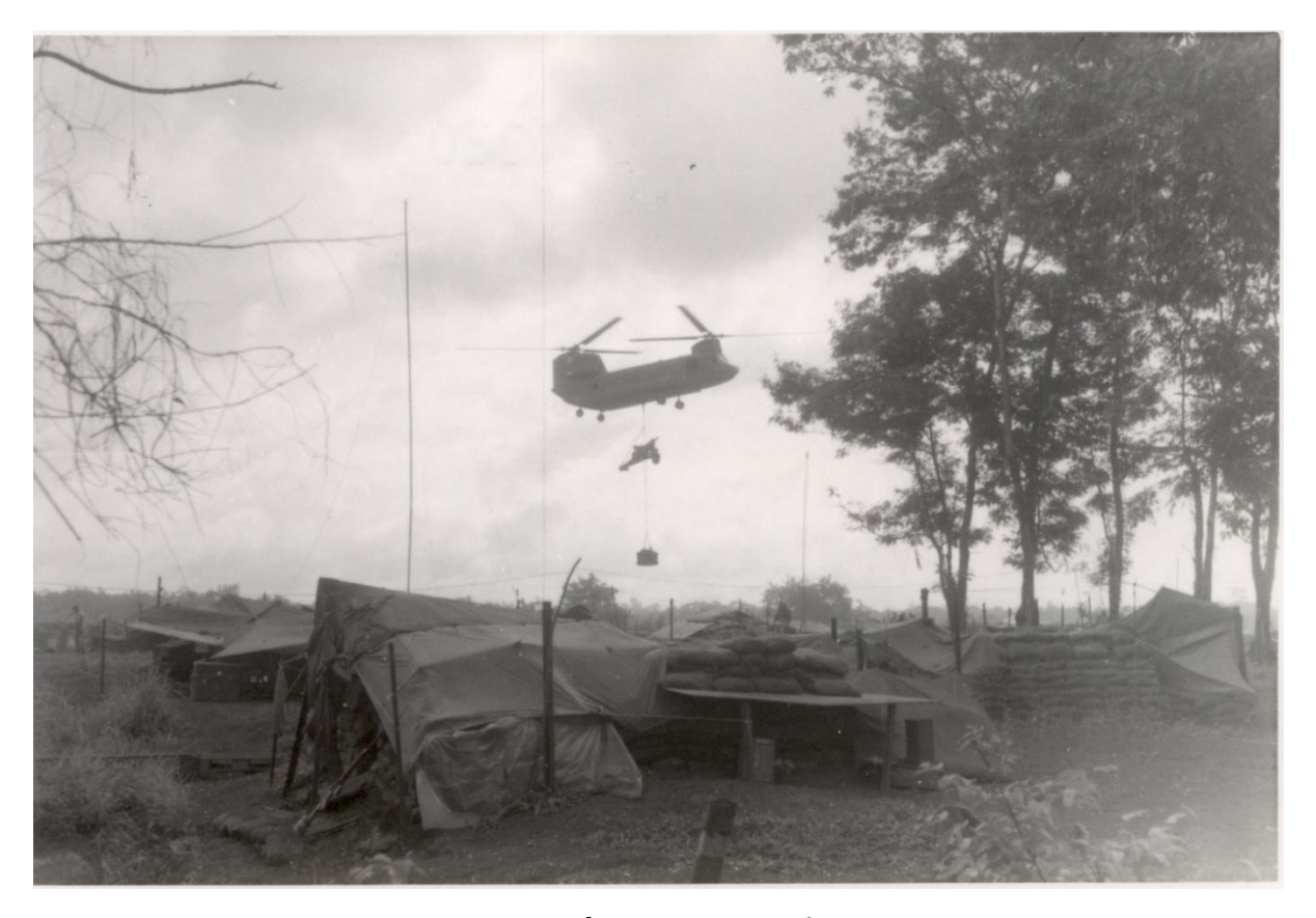
Our replacements arrive

As we left FSB ZIGGIE, it was interesting to see that we were being replaced by 105mm guns and a company of infantry. We were flown out by Chinook Medium lift helicopters. It was fascinating to note that the fuselage of the aircraft I was in had a long crack in the roof. Part way along this crack there was a date. I assumed it was meant to indicate the progress of the crack. It did nothing to assure me that the aircraft was serviceable.