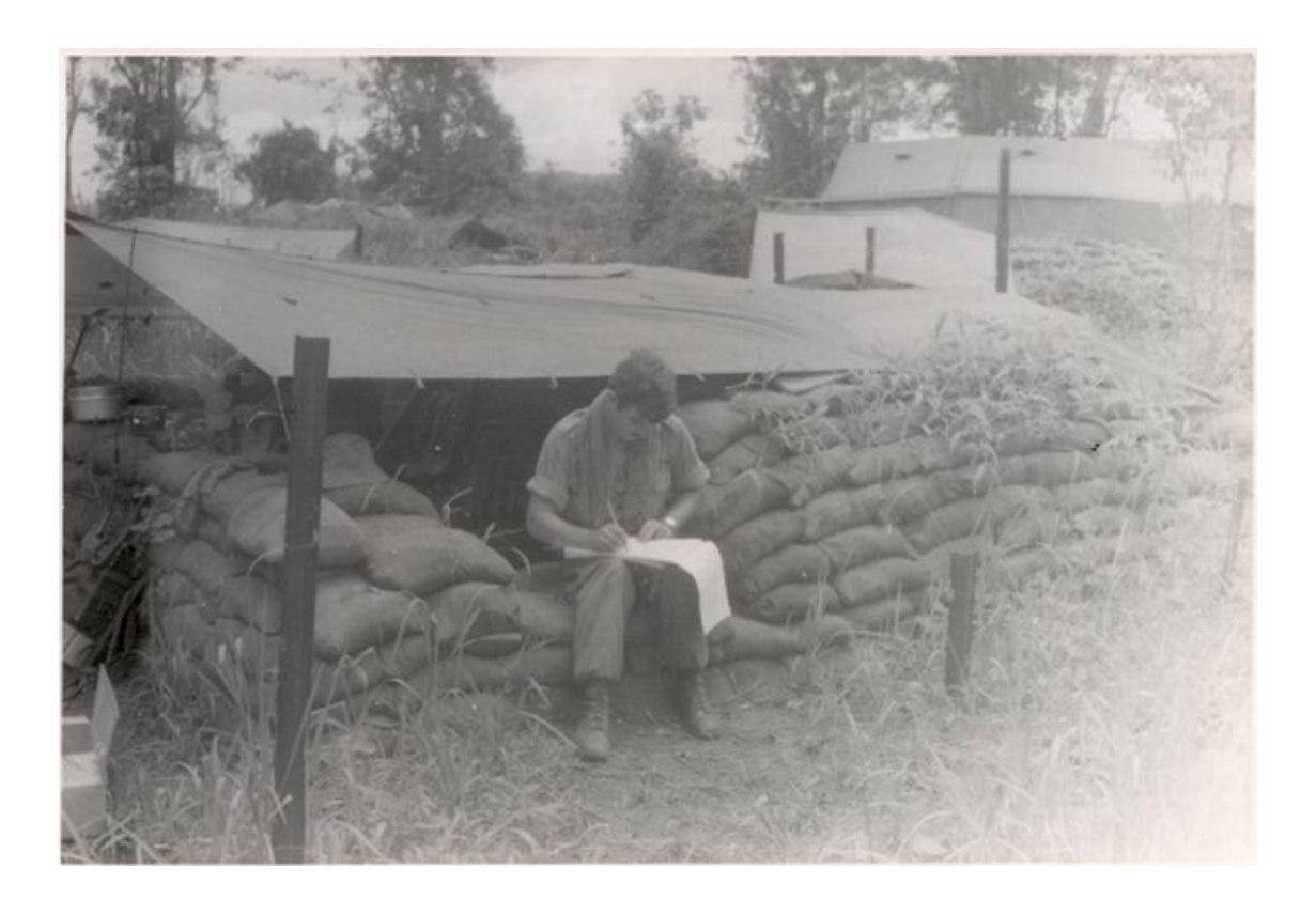
Our Home away from home on FSB ZIGGIE

The Base was well established. The weapon pits were dug below ground level with a fighting area and a sleeping area. There were two separate pits in each location although they were joined at the forward end. Each weapon pit was covered with an Armco half pipe and was well sand bagged up the sides and roof. Hootchies covered both pits. In all, quite comfortable, but you did sleep with what-ever fell into your pit. There was a fair bit of 'surplus' ammunition in each pit, it was just a matter of getting the right kind of ammunition for each weapon type. This was relatively easy as we only had 7.62mm, 5.56mm and linked 7.62mm for the machine gun.