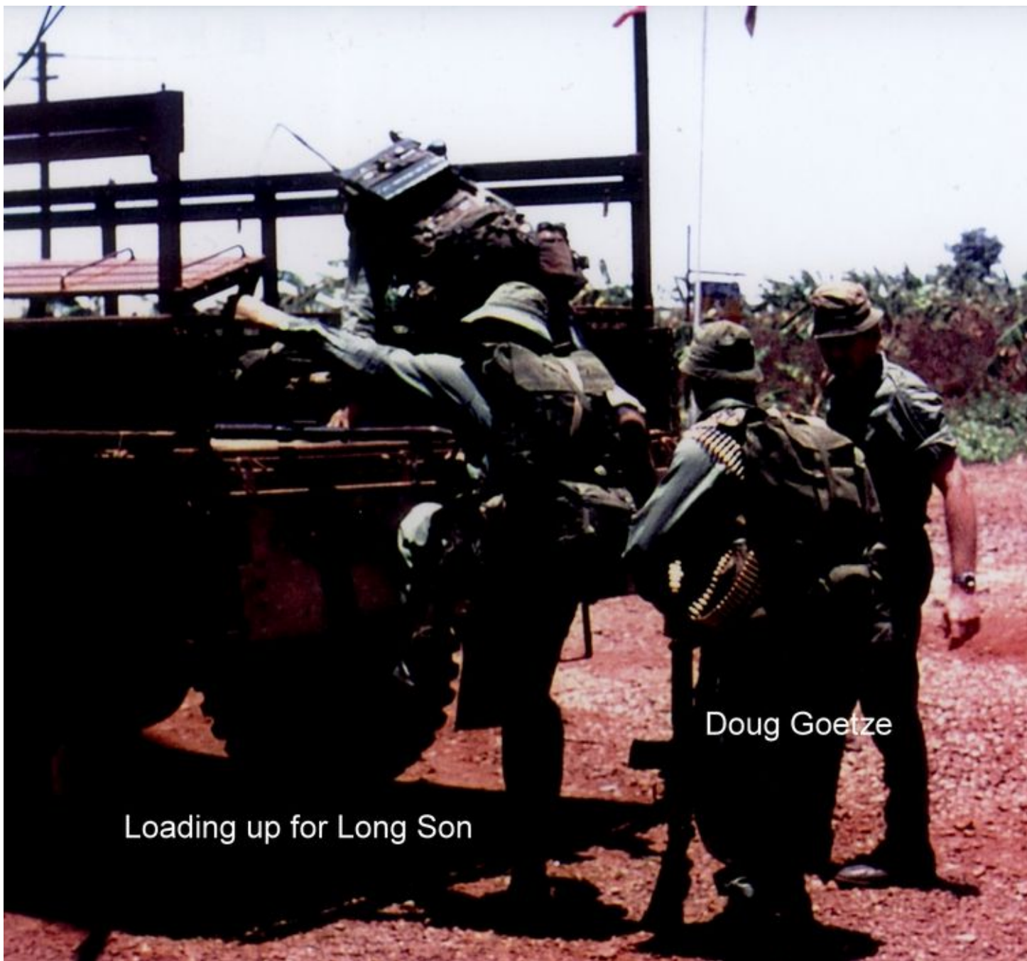
Loading up for Long Son